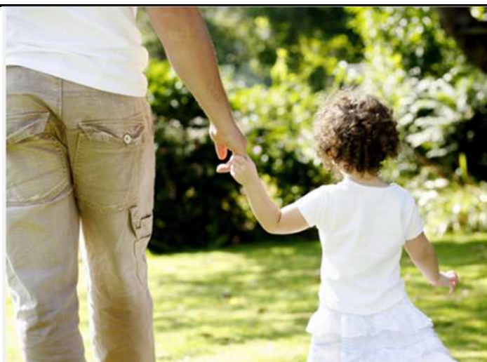
Walk in Nature