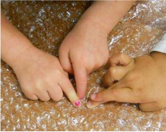
Pop Bubble Wrap