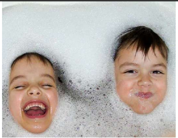
Take a Hot Bath