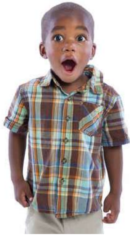
Do a Primal Yell