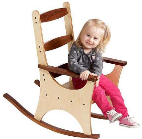
Rock in a Rocking Chair