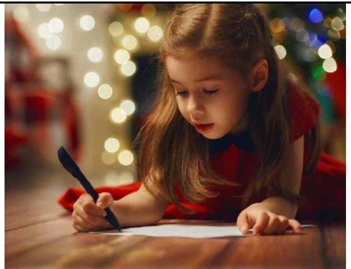
Write a Letter as your BFF