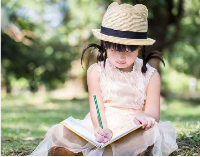
Write it Out