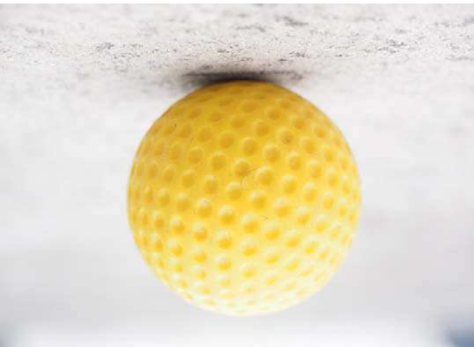
Roll a Golf Ball Under Your Feet