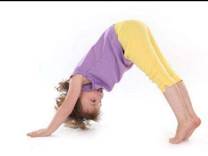
Try Downward Dog Pose