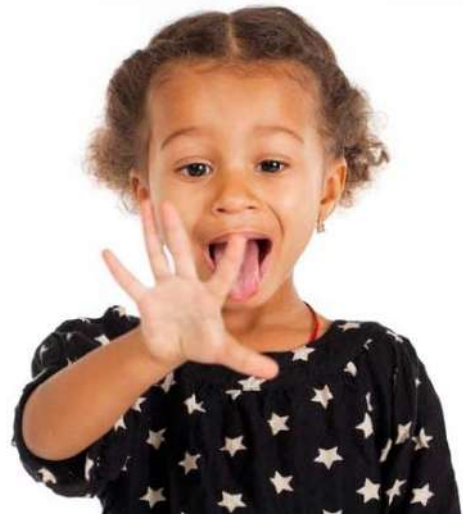
Count to 5