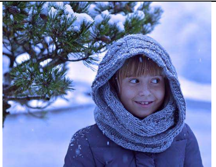
Change the Scenery