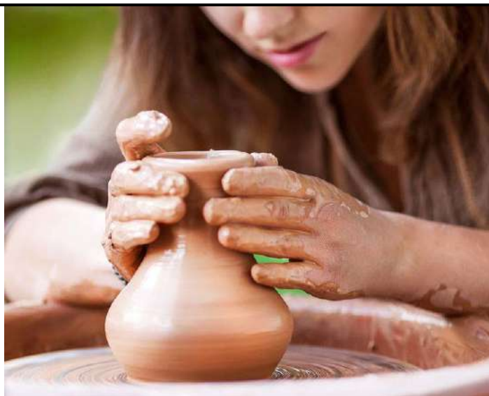
Take up Pottery