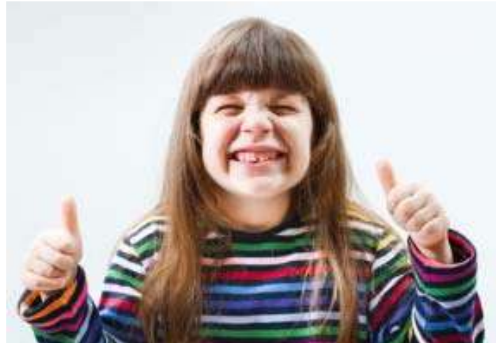
Repeat a Mantra