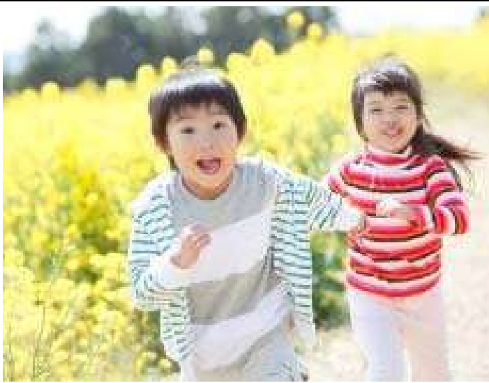
Go for a Run