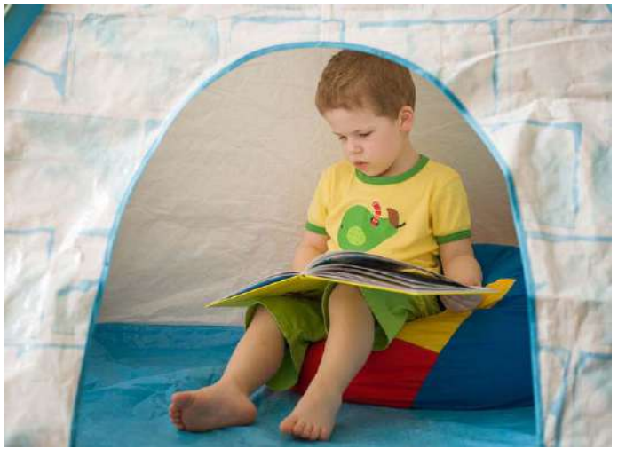
Go to Your Calm Down Space