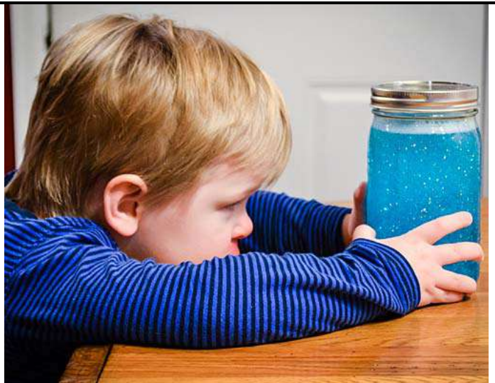
Shake a Glitter Jar