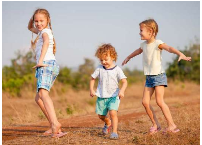
Have a Dance Party