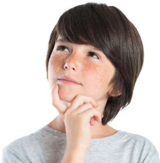
Name Your Emotion