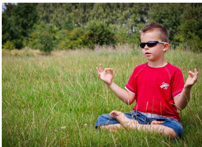
Envision Your Best Self