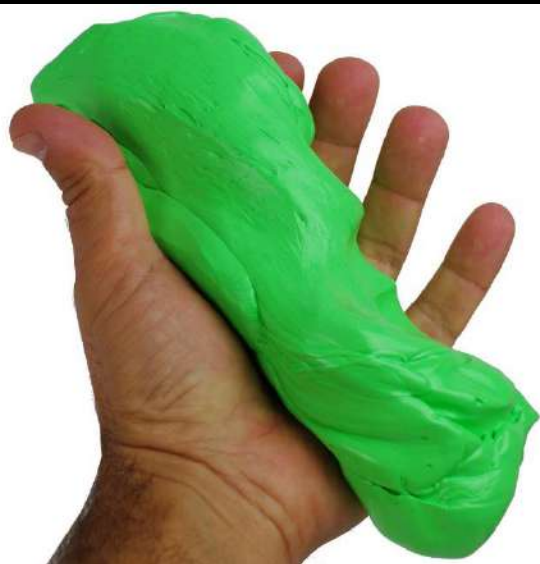
Squish Some Putty