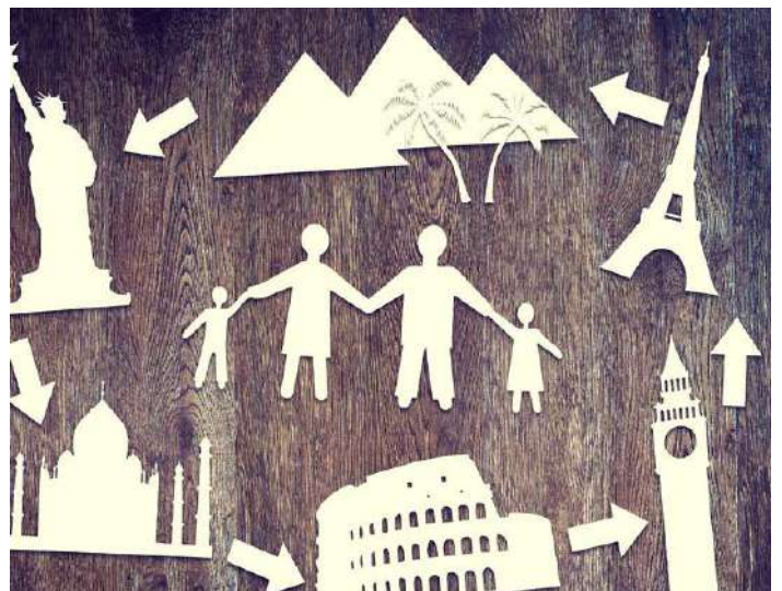
Create a Vision Board