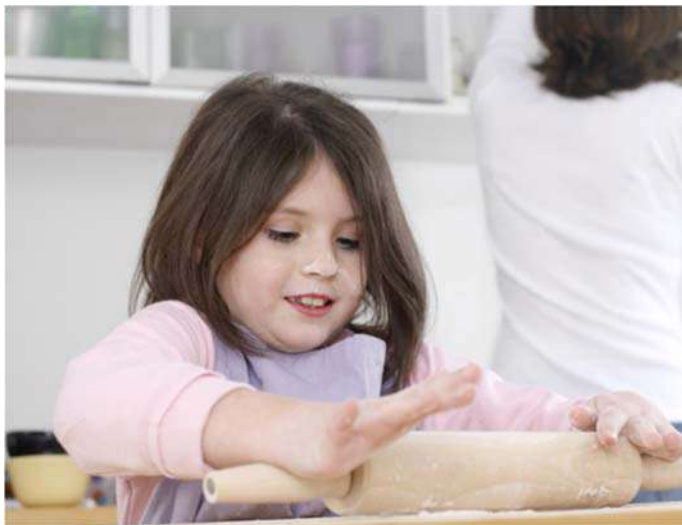
Knead the Bread