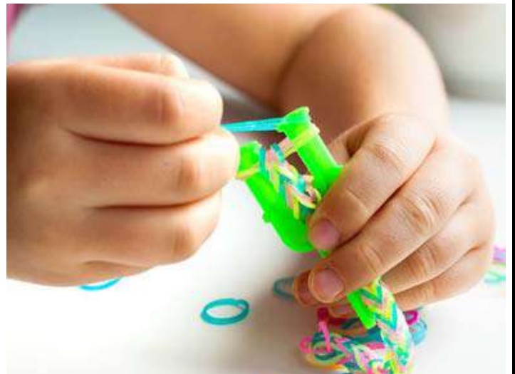
Make a Bracelet