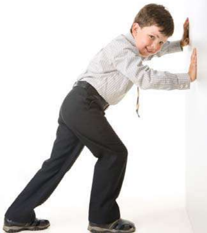
Push Against a Wall