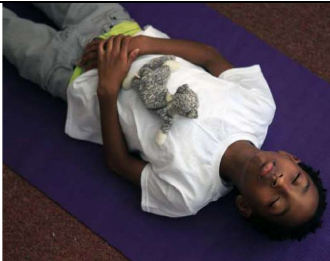
Breathe into Your Belly