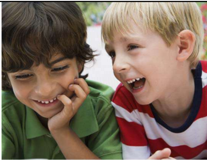
Talk it Out