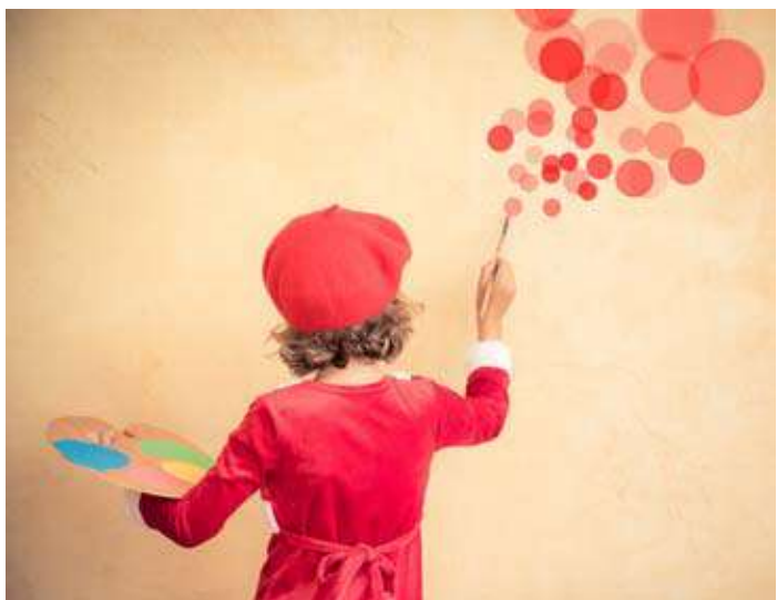
Decorate a Wall