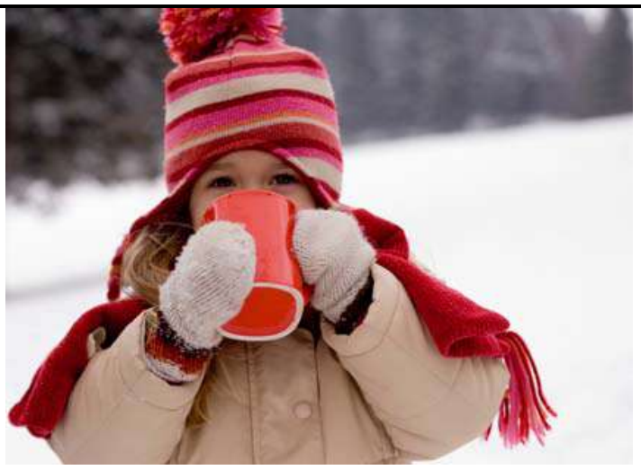
Have a Cozy Drink