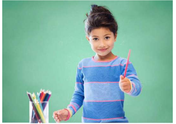
Take a Coloring Break