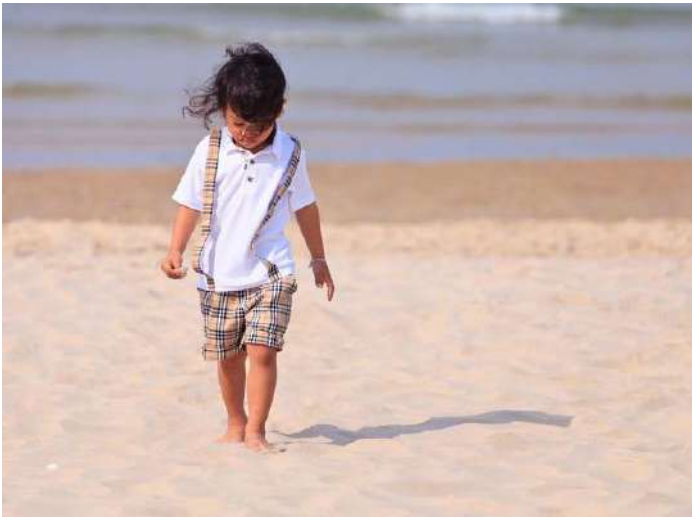
Go for a Walk