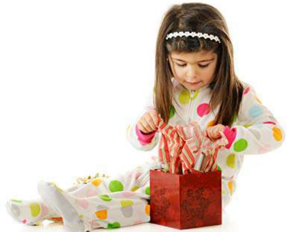
Crinkle Tissue Paper