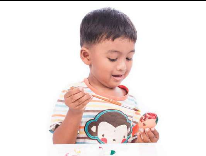
Paint it Out