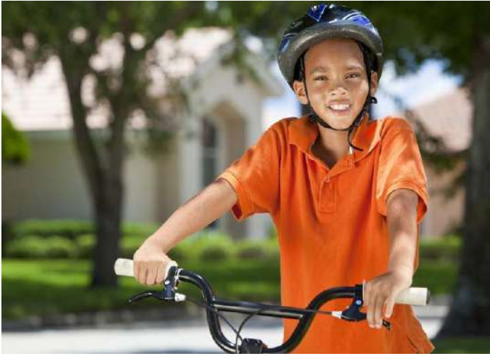
Get on a Bike