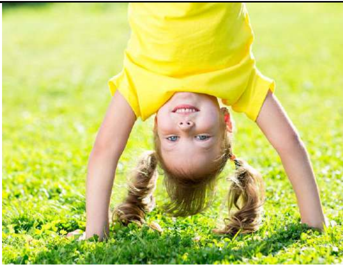
Try an Inversion