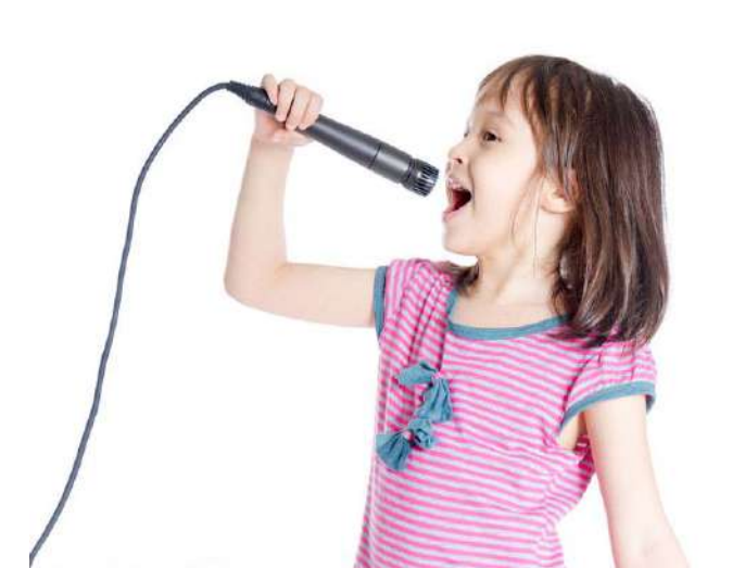
Sing Out Loud