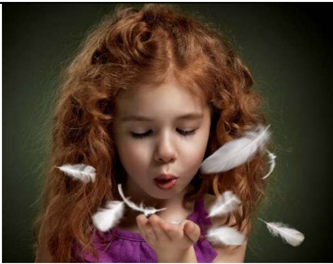
Blow on Feathers