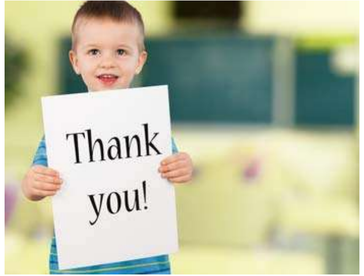
Gratitude, Gratitude, Gratitude