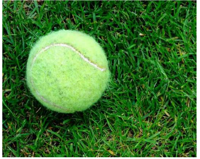
Roll a Tennis Ball on Your Back