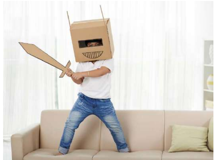
Plan a Fun Activity