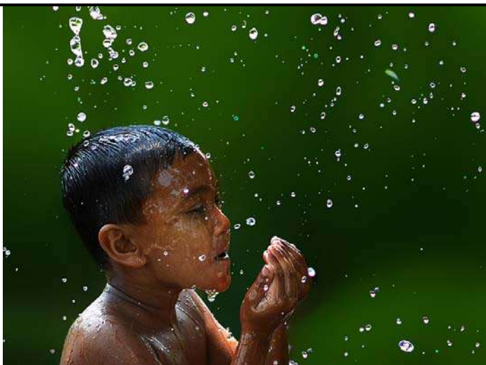
Take a Cold Shower