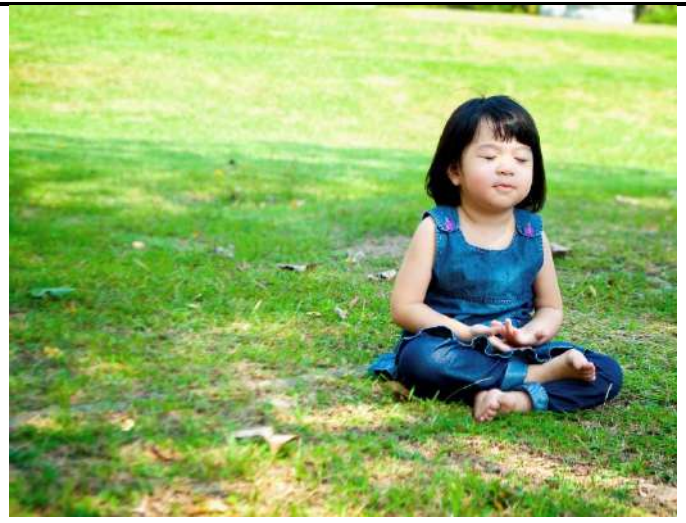
Visualize a Quiet Place